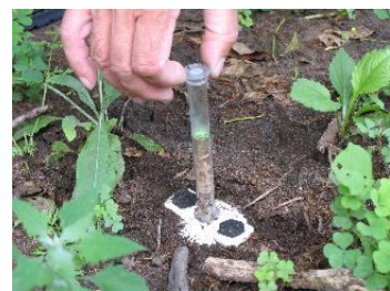
A tripped alert equals a termite job.