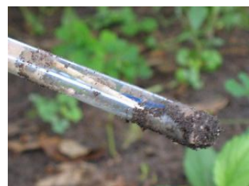
Destroyed CTA is proof for the customer.